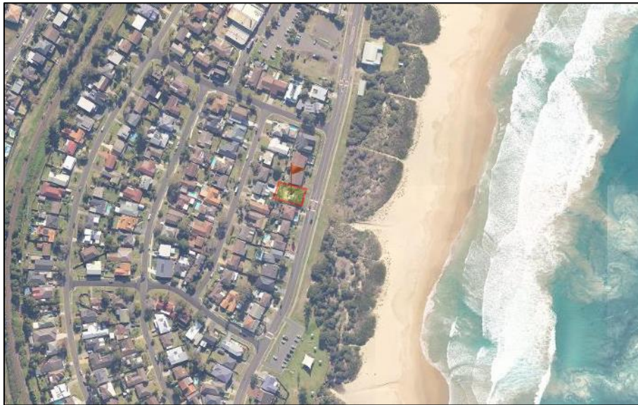
Figure 5 – Aerial Image 133 North Kiama Drive