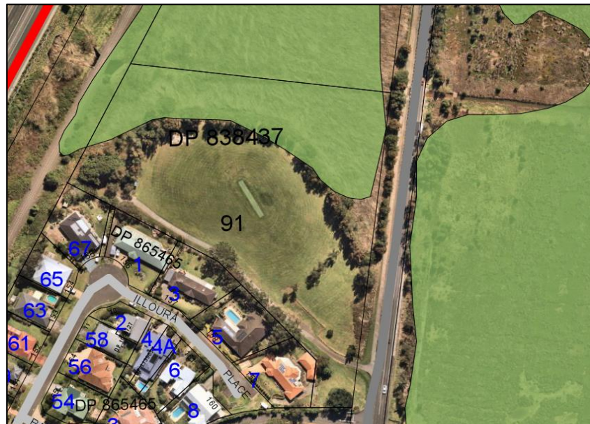
Figure 7 – Terrestrial Biodiversity Overlay Lot 91 DP 838437