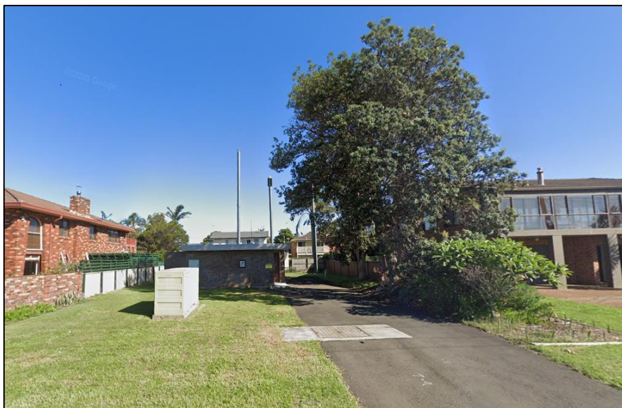
Figure 6 – 133 North Kiama Drive