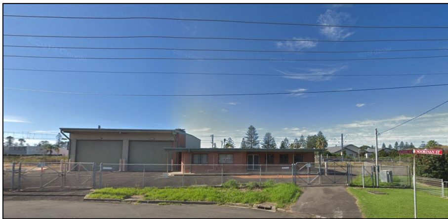
Figure 4 – 20 Eddy Street

The PP also seeks to rezone 133 North Kiama Drive from R2 Low Density Residential to SP2 Infrastructure – Water Supply System to better reflect the use of the site for Sydney Water infrastructure. The site has an area of 556m 2 and is located in Kiama Downs surrounded predominately by residential development. The site is owned by Sydney Water Corporation and contains existing water supply infrastructure. The site is shown in Figures 5 and 6 below: