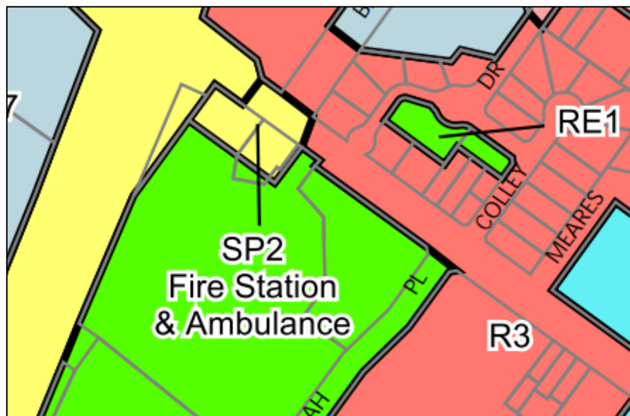
Figure 1 - Current Zoning Annotation of 206 & 210 Terralong Street

The PP seeks to amend land use annotations for certain sites that are not annotated with a land use listed within the infrastructure categories of the Infrastructure SEPP or the Standard Instrument dictionary. An example of this is Figure 1 shown below: