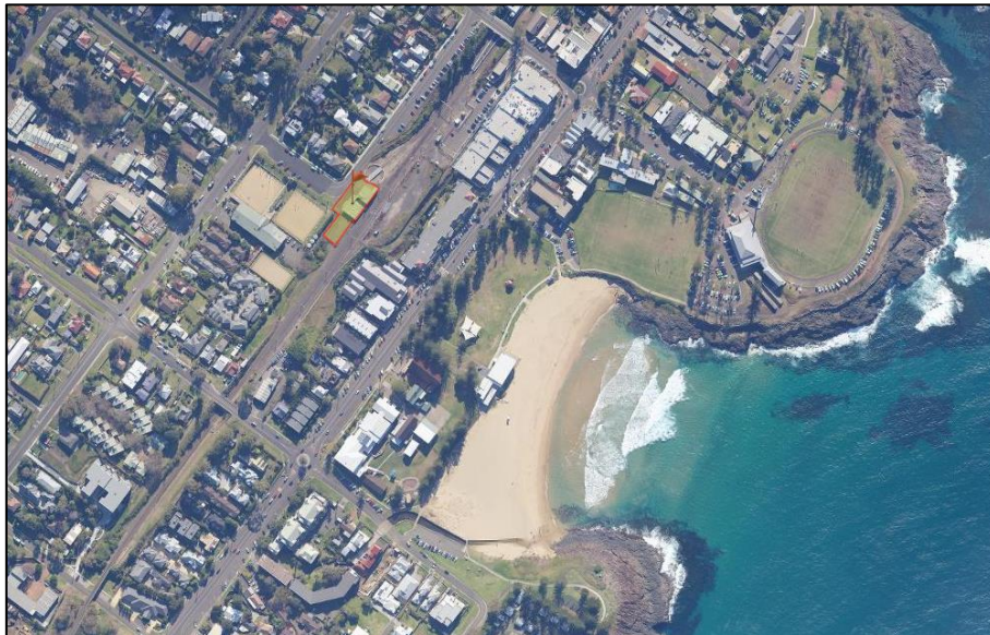
Figure 3 – Aerial Image 20 Eddy Street